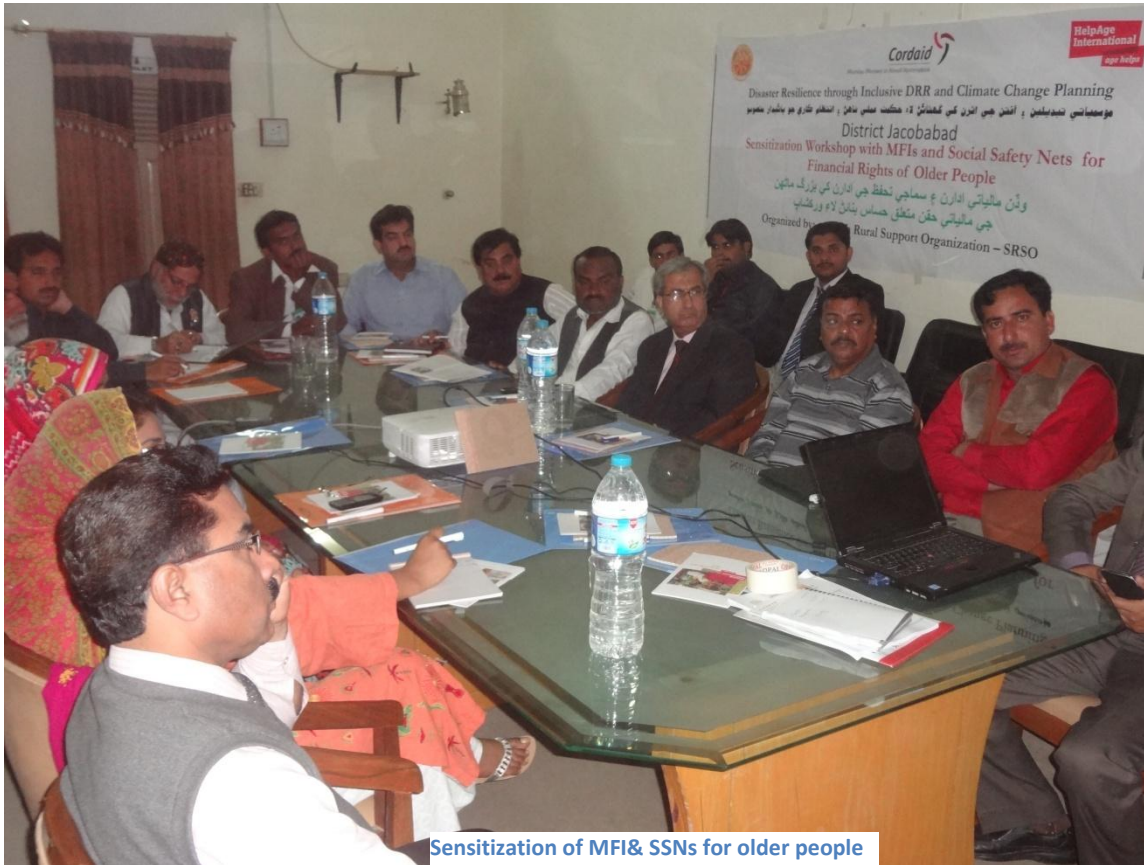
Sensitization of MFI& SSNs for older people