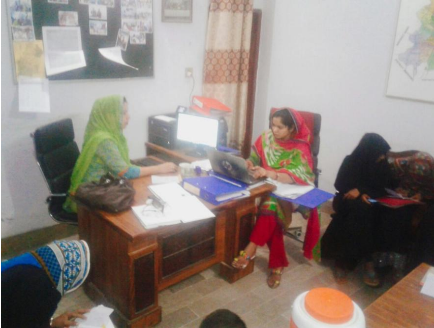
Different coordination meetings with health department and national programme