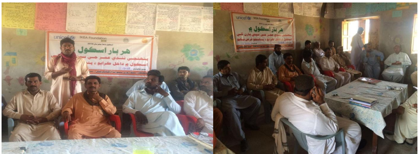
Co-Ordination Meeting with Teachers of Uc-Lohi For Enrollment Under CRCFA Project