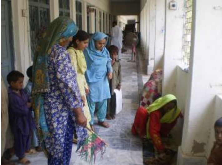
Clean Camp Campaign