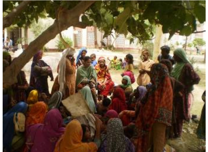
Hygiene Sessions in relief camp