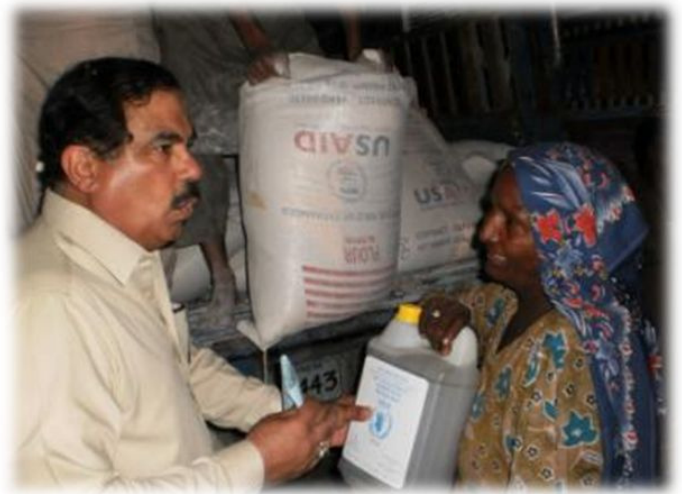
DCO Kashmore Kandhkot in distribution of WFP food for flood affectees