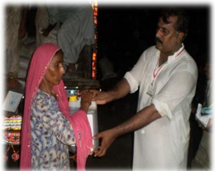
Distribution in PSO pump camp Guddo