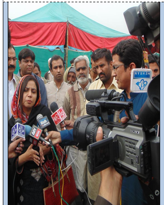
CEO-SRSO Responded to ARY, AWAZ, Sindh TV, Mehran TV