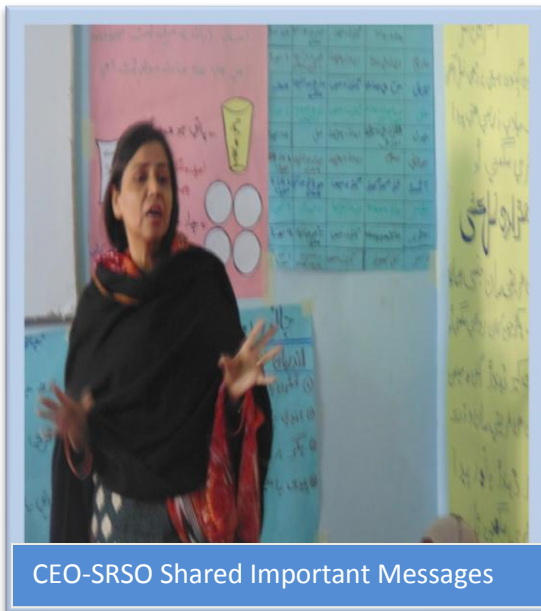
CEO-SRSO Shared Important Messages

provided 6 days of Livestock Management Training to selected 0-18 PSC Holder from Experienced Trainer, you all LSO Elective member were inviting here to learn and understand completely this new concept, and you must share with your LSO, VO, CO Members, This is also preach because SRSO Always worked for you, always prefer those ideas, which will change your life style, which will increase your Source of income, SRSO have many new ideas , that's basic one purpose is to reduce the poverty from our community.