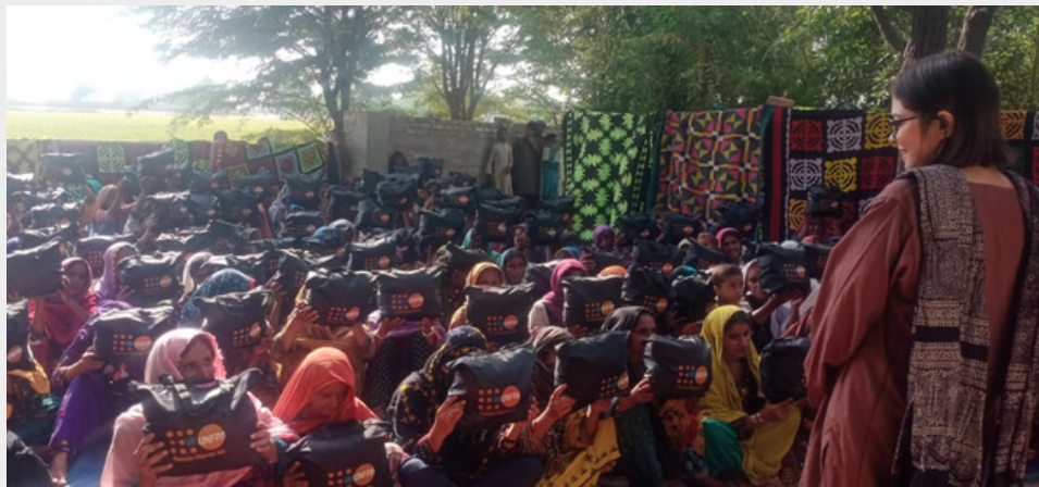
12th Nov 2022, SRSO District Kashmore Distributed 50 Female Dignity Kits in VO Sohrab Pathan Talika Kandhkot