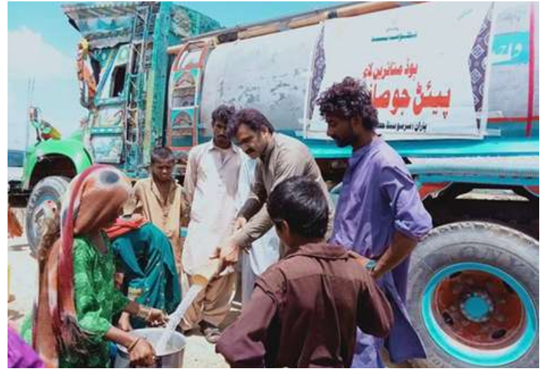
August 30, 2022 SRSO Thatta Team arranged a Tanker of drinking water for rain and flood-affected families of village Ismail Mirbahar, Ramzan Jakhro, Aboro Jakhro, Dino Macchi, Essa Jakhro, and Mussa Jakhro, in UC Faqeer Jo Goth at IDPs camp- Baghar Panha band in Taluka and district Thatta.