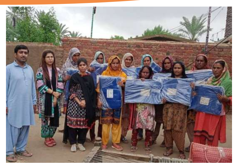
August27, 2022 SRSO'- Crafts Enterprise Development (CED) team with the financial support of JICA Light-F Project officials distributed Tarpaulin Sheets in families of District Sukkur & Khairpur.

August31, 2022 SRSOpProvided 60 Mosquito Nets among flood affected communities of UC Khirohi in Taluka Daharki and District Ghotki. with the support of district administration of Ghotki.