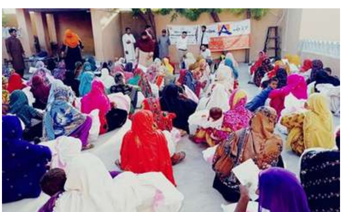
August 31, 2022, SRSO Khairpur Team distributed ration bags (carrying essential food items to feed a family for 10-15 days) among flood-affected families at village Alam Khan in UC Ripri of taluka Gambat and dist Khairpur. Ration Bags were provided by Allied Bank Ltd.