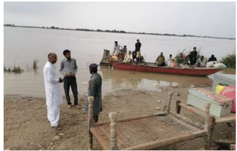
Ghotki/September24, 2022 Relief efforts and Rescue Operation by SRSO in flood affected areas of District Ghotki and 9 families have been shifted to safer places.