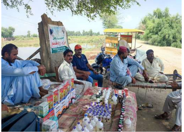
August27, 2022 SRSO under Brooke project organized veterinary camp for rain affected livestock and equine Animals at village Bhiro Total 990 cattle and buffalo vaccinated H.S vaccine PPR & ET vaccines total 1015 goat and sheep vaccinated Total 2005 animals were vaccinated