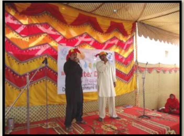
Govt: Primary School, Village Wahid Bux Bhayo, Distt: Kashmore @ Kandh Kot