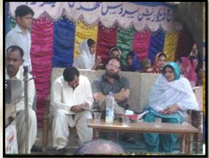
Government High School, village Rasoolpur, Hindyari, Thari Mirwah at Khairpur