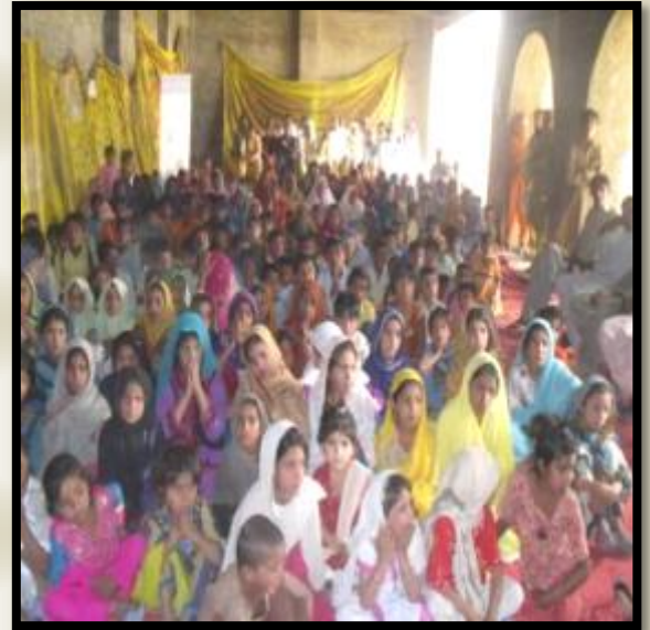
Govt: Primary School, Village Jenand Khan Jarwar, Distt: Qambar-Shahdadkot @ Qambar