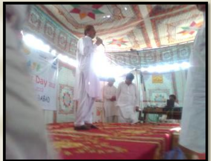
Government Boys School, village Bachro, Thull, Jacobabad